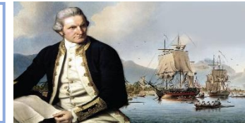
Captain James Cook