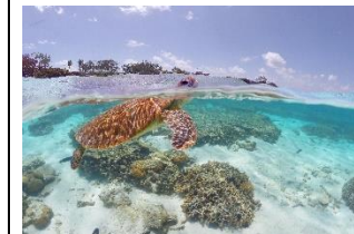
Great Barrier Reef